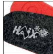
Certified winter insole