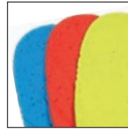
HAIX® Vario Wide Fit System