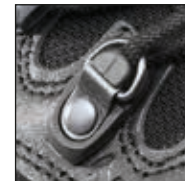
HAIX® 2-Zone Lacing