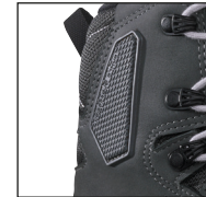
HAIX® Ankle Protector System