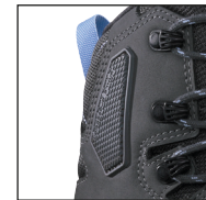
HAIX® Ankle Protector System