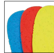
HAIX® Vario Wide Fit System