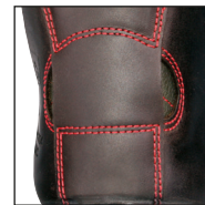
HAIX® FP System