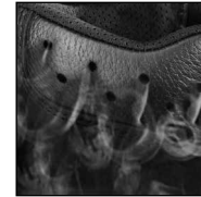
HAIX® Climate System