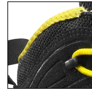
HAIX® Climate System