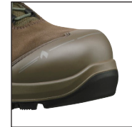
HAIX® Nano-Carbon Toe Cap